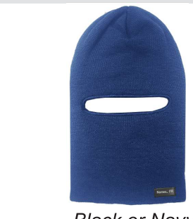
Black or Navy 454 BEANIE