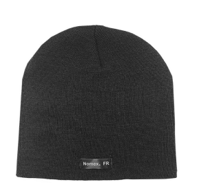
Black or Navy